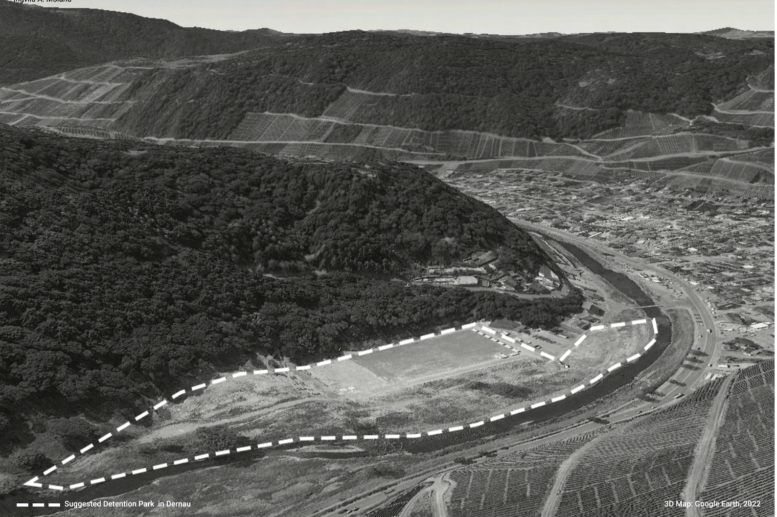
--- Suggested Detention Park in Dernau