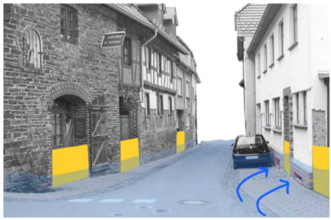
Waterproof doors and Floodable basements