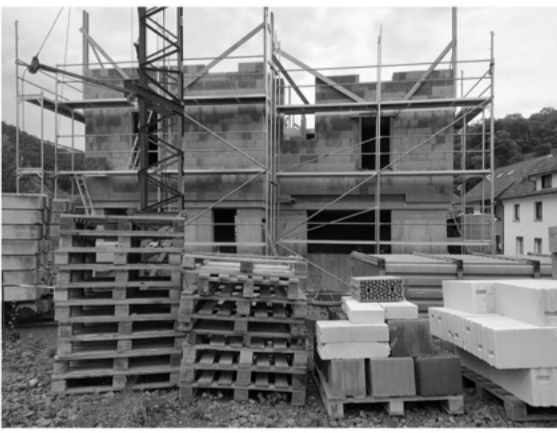
Use of appropriate construction materials