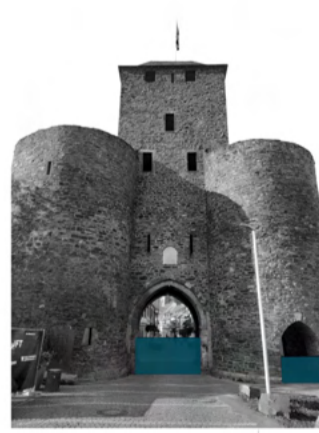
Floodgates The old town of Ahweiler is surrounded by thick wall and a trench inside. This area contains the traditional Timber houses which are located densely. In this area, a common measure such as use of Floodgates is preferable instead of individual flood proofing of each building.