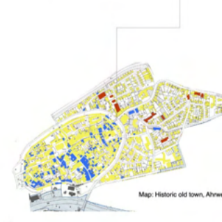
Map: Historic old town, Ahweiler