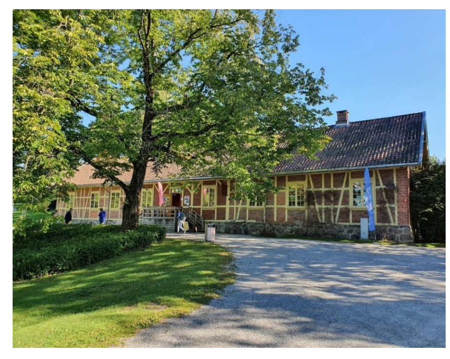
The SiÅs Housing Office and Boksmia (university bookshop) are housed in the above building which is located next to the duck

If you will be living on campus, you must arrange to pick-up your keys from the SiÅs Housing Office. The office is located next to the duck pond as shown on MazeMap. Regular office hours are between 10:00 - 15:00 during weekdays. You can email them at utleie@sias.no with your arrival date and time. If you are arriving after hours, they will provide special instructions for how to pick-up your keys. Remember to inform SiÅs of your time of arrival.